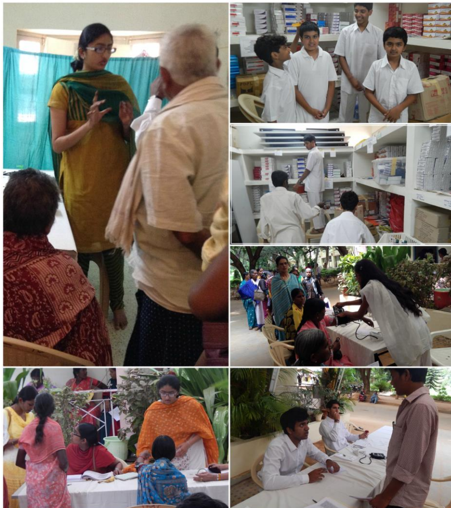
Young adults in action at Registration, Translation and Pharmacy.

These Medical Camps also provide a blessed opportunity for Young Adults (medical professionals, medical students, and non-medical persons) to take an active role in organizing these medical camps and participating in various activities, including direct patient care for medical volunteers, and camp set-up, registration, patient assistance, and pharmacy inventory maintenance, for non-medical volunteers.